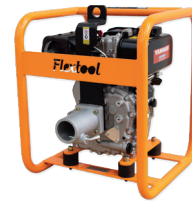
FDU-DE2 (Diesel electric start)