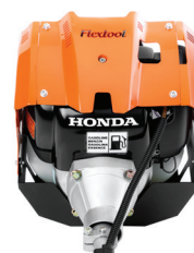
Engine Guard Front