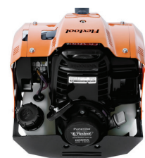
Engine Guard Back