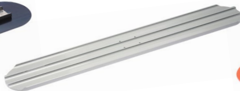
FT4K0071-UNIT (CC803-01) Kraft Tool Co Magnesium Bull Float Round End - Blade only