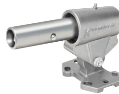
FT4K0077-UNIT (CC296) Kraft Tool Co Tilt Float Bracket Kuncklehead Aluminium - 6 hole