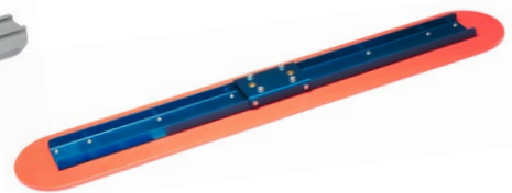
FT4K0072-UNIT (CC2020RE) Kraft Tool Co Orange Thunder Bull Float Round End - Blade only