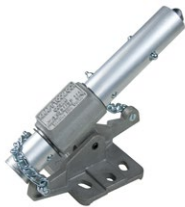
FT4K0078-UNIT (CC294) Kraft Tool Co Tilt Float Bracket EZY-Tilt Aluminium - 6 hole