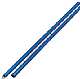
FT4K0087-UNIT (CC289SB) Kraft Tool Co Anodised Aluminium Handle