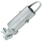
FT4K0094-UNIT (CC295) Kraft Tool Co EZy-Tilt Button Handle Adapter