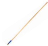
FT4K0093-UNIT (CC266) Kraft Tool Co Steel Clevis Wood Handle