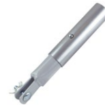
FT4K0089-UNIT (CC284) Kraft Tool Co Clevis Button Handle Adapter