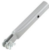
FT4K0090-UNIT (CC332) Kraft Tool Co Clevis Button Handle Adapter