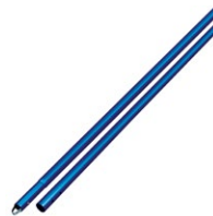
FT4K0087-UNIT (CC289SB) Kraft Tool Co Anodised Aluminium Handle