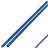
FT4K0087-UNIT (CC289SB) Kraft Tool Co Anodised Aluminium Handle