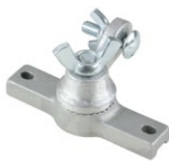
FT4K0095-UNIT (CC298) Kraft Tool Co All-Angle Fresno Bracket