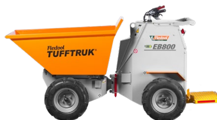
EB800 (Special Order)