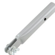
FT4K0090-UNIT (CC332) Kraft Tool Co Clevis Button Handle Adapter