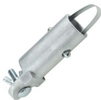
FT4K0094-UNIT (CC295) Kraft Tool Co EZY-Tilt Button Handle Adapter