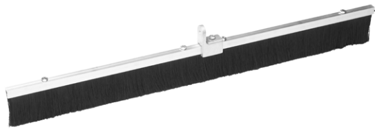
FT4K0084-UNIT (CC156) Kraft Tool Co Finishing Broom Weigh-Lite Soft Poly