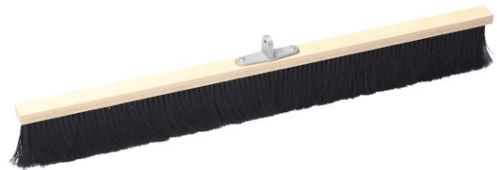
FT4K0083-UNIT (CC457) Kraft Tool Co Finishing Broom Soft Nylon